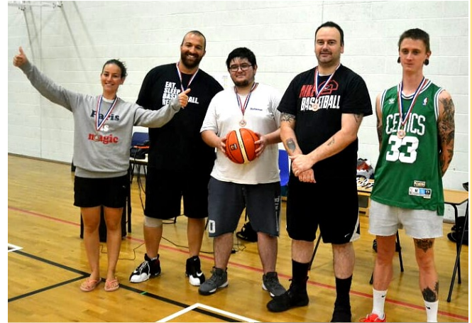
3rd classified - Team London