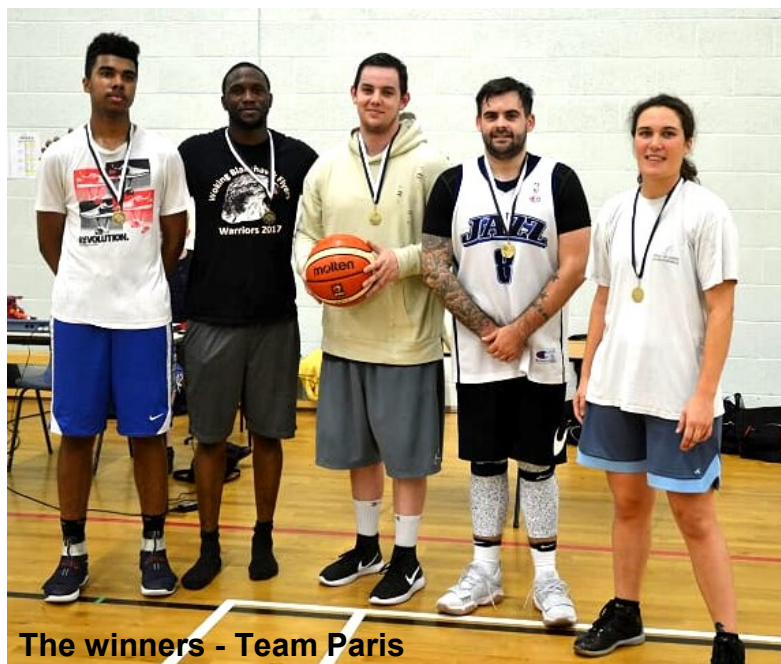
The winners - Team Paris

London avenged their scoreless game to win 3 rd place over Athens, while Rome and Paris met in the finals. Paris leapt out to an early lead, but some hot shooting from Rome looked like it might change the course of the game. It was not to be, as a couple of dagger 3-point shots and scores at the rim sealed the victory and the championship for team Paris.